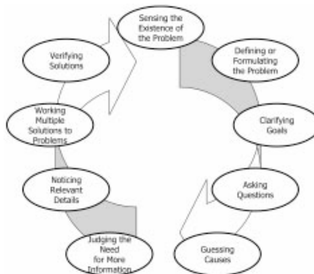
Fig. 2. Problem-solving pathway (adapted from Hoover and Feldhausen, 1994).